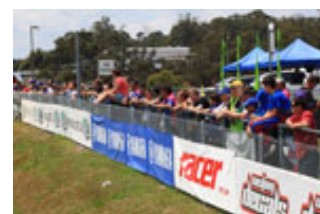
The racing was action packed all throughout the weekend.